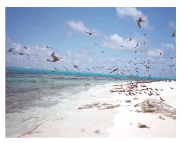
Mellish Reef Grid Locator QH72wo 17 deg 24 min 39 sec South 155 deg 53min 25 sec East

These have to be confirmed, as they are less than a fortnight old at the time of writing. With these four new counties it lifts Norm's total country count to 88, only 12 to go! Norm will be the first 'Z' call in Australia to have worked 100 confirmed countries on six metres.